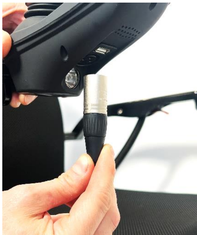
3. Route the joystick cable in a practical way to avoid getting caught or damaged while using or folding the wheelchair. Connect it to the charging port of the main joystick.