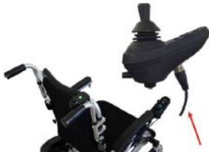
4. Connect the cable from the control unit to the joystick according to the picture.