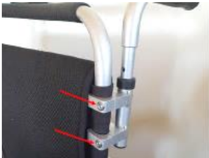
1. Assemble the handles by tightening the two screws according to the picture.

To facilitate maneuvering the wheelchairs from behind (as assistant, companion etc.) the wheelchairs can be equipped with an A-kit. It consist of an Assistant handle and a thumb joystick.