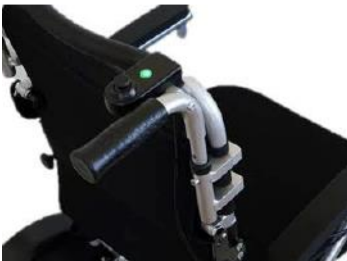
3. Fasten the thumb joystick on the mounting bar.

Remove the control unit, reposition the parts in the order shown in the pictures, (1,2,3) then reattach the control unit.