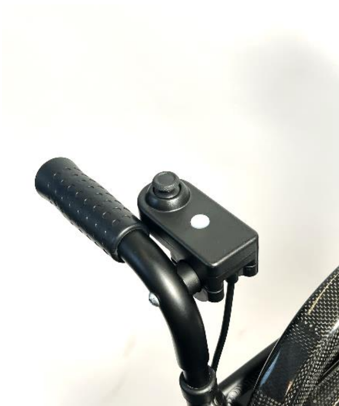
4. Fasten the thumb joystick on the mounting bar.