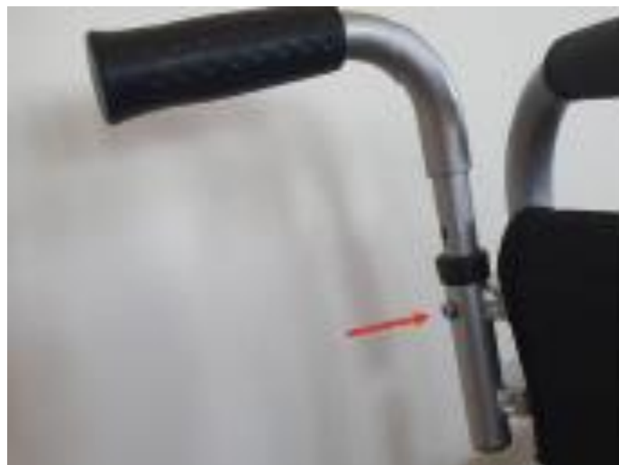
2. Adjust the height of the handle by loosening the screw according to the picture.